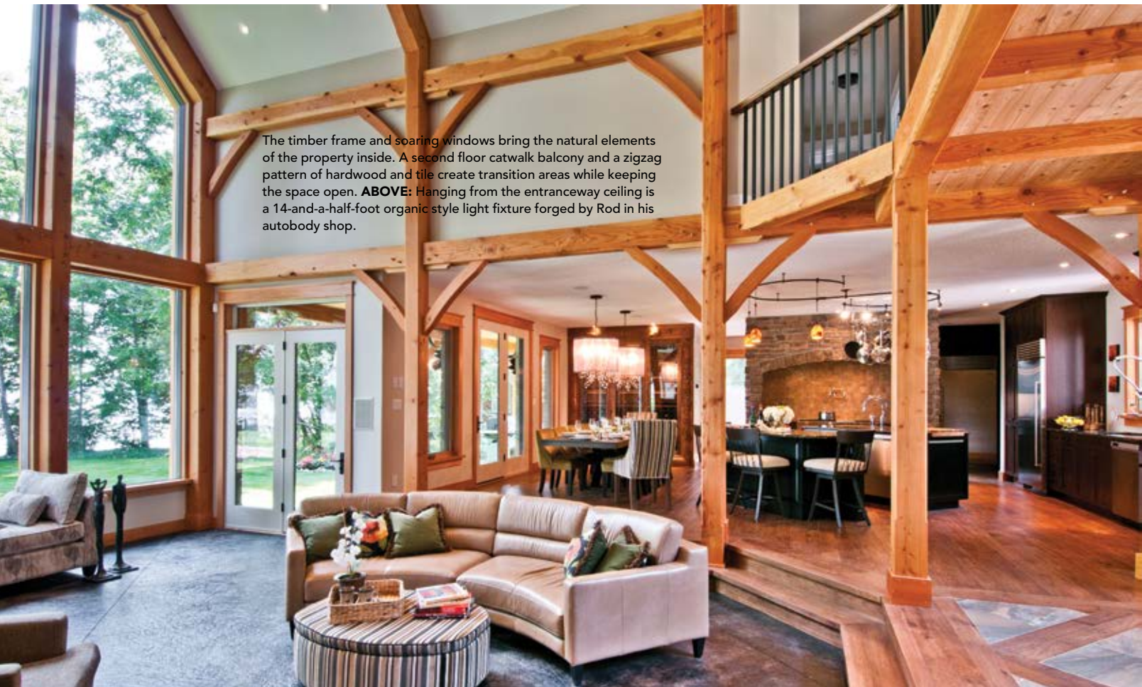
The timber frame and soaring windows bring the natural elements of the property inside. A second floor catwalk balcony and a zigzag pattern of hardwood and tile create transition areas while keeping the space open. ABOVE: Hanging from the entranceway ceiling is a 14-and-a-half-foot organic style light fixture forged by Rod in his autobody shop.