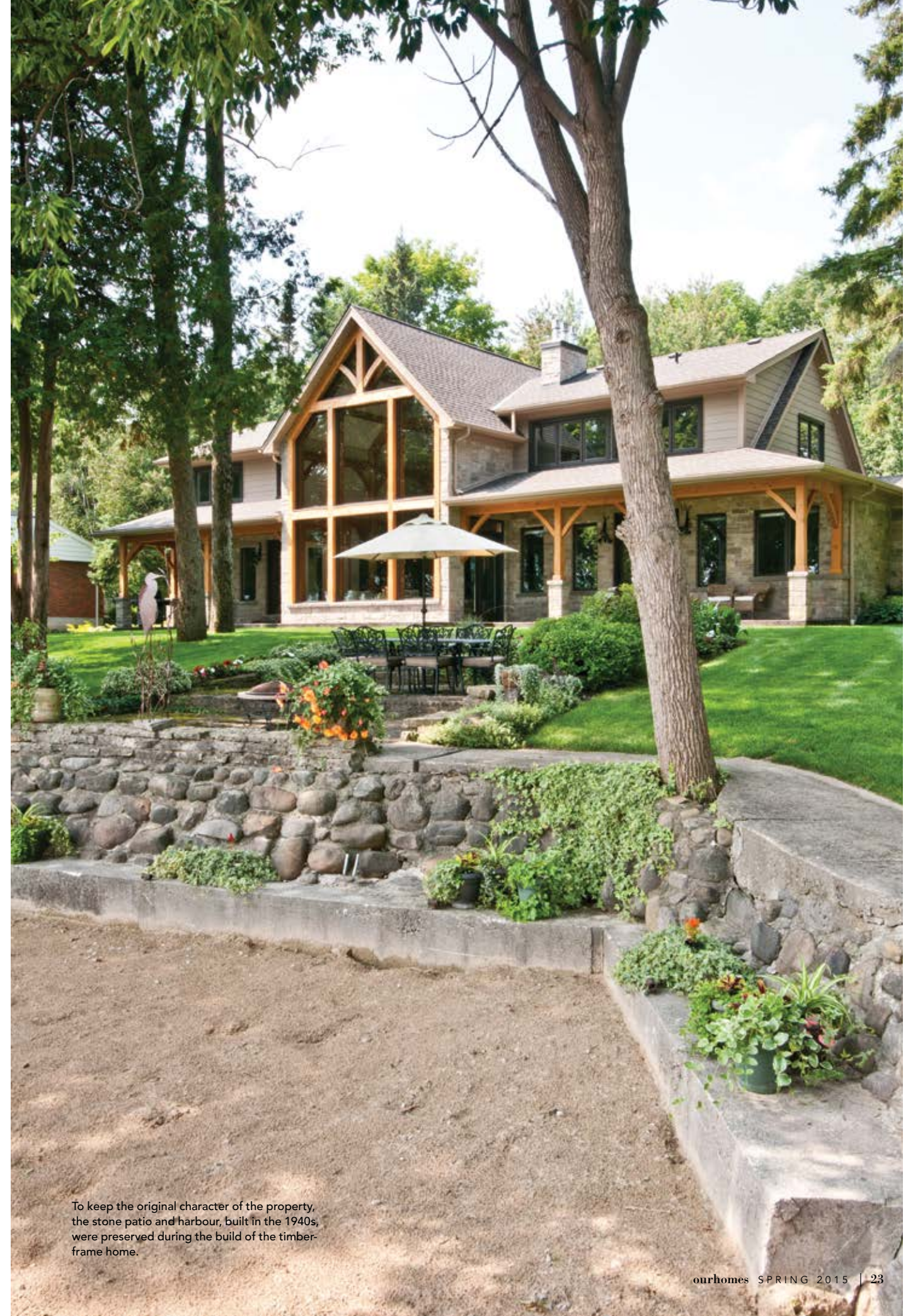
To keep the original character of the property, the stone patio and harbour, built in the 1940s, were preserved during the build of the timber-frame home.