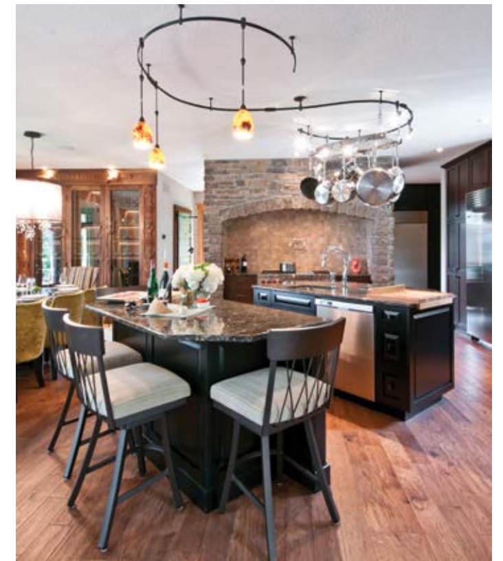
ABOVE FAR LEFT: A refrigerated floor-to-ceiling wine cellar adorns one wall of the kitchen. Note the intricate detailing in the wood trim and the custom iron handles. ABOVE LEFT: The powder room vanity is made from a slab of four-inch thick white ash, which Rod sawed in the 1980s when he ran a sawmill. The sink is chiseled out of solid river rock. ABOVE: The two-island kitchen maximizes eating, entertaining and work space. LEFT: The 10-foot long dining table is an open invitation to join the Matthews for dinner.