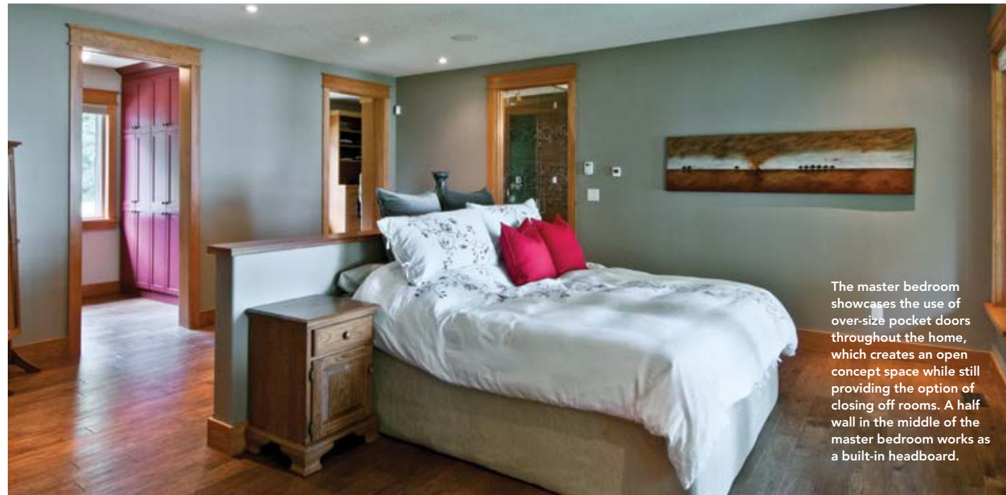
The master bedroom showcases the use of over-size pocket doors throughout the home, which creates an open concept space while still providing the option of closing off rooms. A half wall in the middle of the master bedroom works as a built-in headboard.

also polished but in a warmer vein-cut variety. The main floor laundry room is done with the same fleuri cut, but hand sanded to keep the colour grey. Finally, the hearth is also fleuri cut but honed to have less shine.