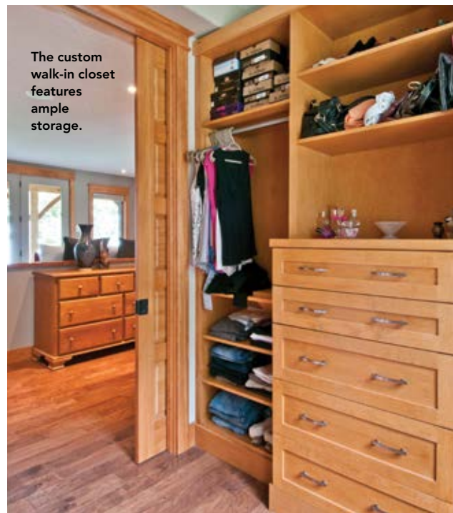
The custom walk-in closet features ample storage.

While the home itself is a masterpiece by Clancy Builders, the gardens and the kitchen continue to show off the masterful work of Rod and Kissten. OH