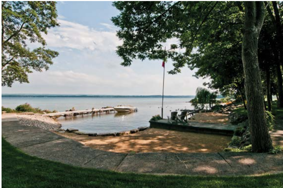
Above: Rod and Kissten Matthews take a break in the shade on their backyard stone patio, which overlooks the sweeping lawns, colourful gardens and towering trees of the property. RIGHT: The unique aluminum DockinaBox system and a sandy beach complete the home's landscaping.