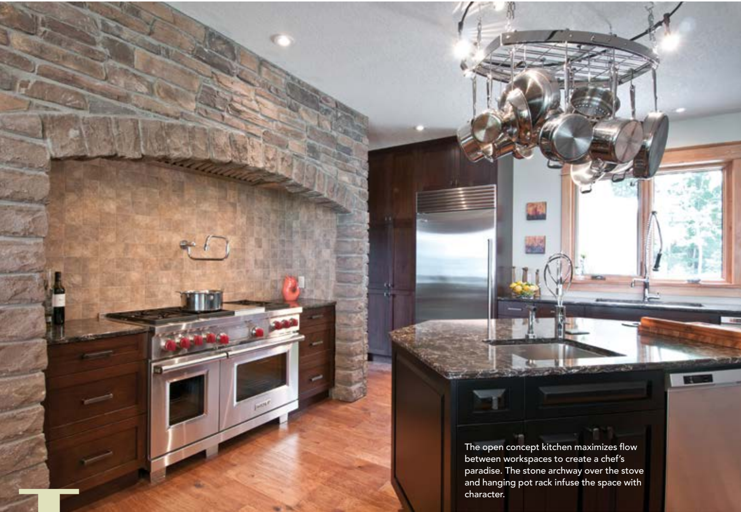
The open concept kitchen maximizes flow between workspaces to create a chef's paradise. The stone archway over the stove and hanging pot rack infuse the space with character.

In the year since the couple moved in, their gas Wolf range and eight-appliance kitchen has plated meals as extravagant as some of Owen Sound's finest eateries. Equipped by Macdonald's BrandSource Furniture & Appliances in Meaford, the kitchen features a double oven, microwave, warming drawer, two dishwashers, Sub-Zero fridge and an upright freezer. Let's not forget the 100 cu. ft. walk-in cooler where Rod ages loins of beef, or the walk-through pantry stacked ceiling-high, or the oversize industrial stainless-steel sink.